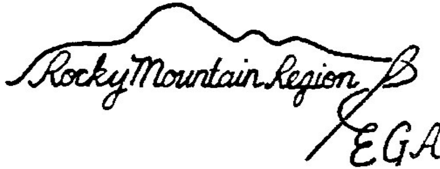
Rocky Mountain Region Logo